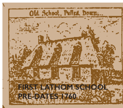
Old School, Pulled Down... FIRST LATHOM SCHOOL PRE-DATES 1760