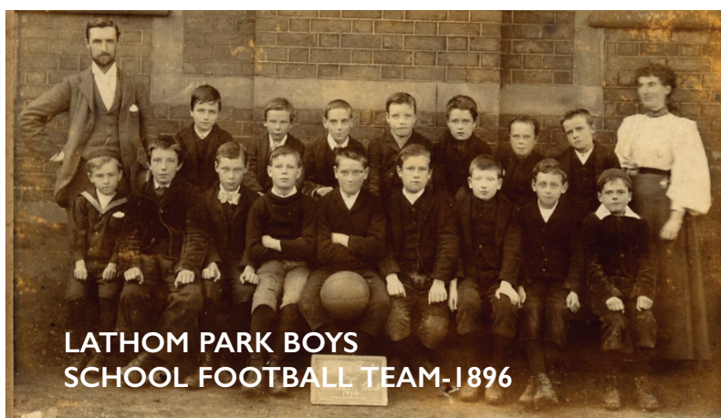
LATHOM PARK BOYS SCHOOL FOOTBALL TEAM-1896