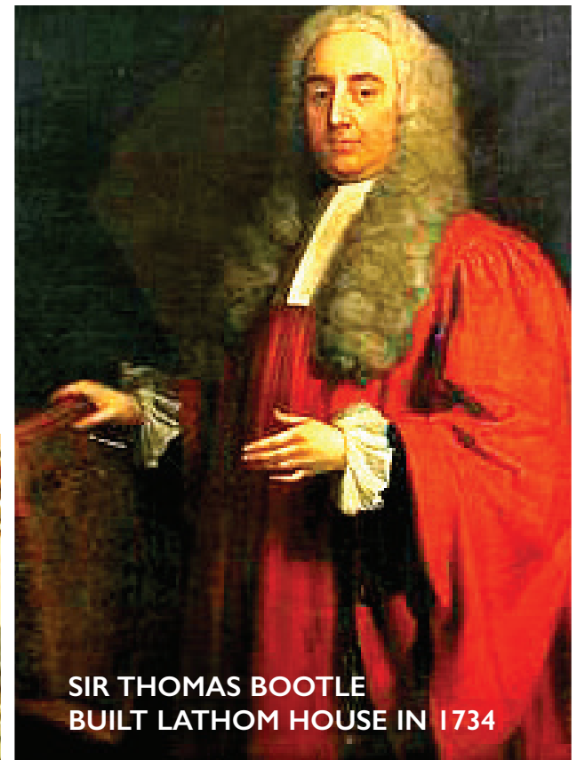
SIR THOMAS BOOTLE BUILT LATHOM HOUSE IN 1734

Thousands of horses trained in Lathom Park for World War I. First Lathom school in 1760 provides free education for boys.