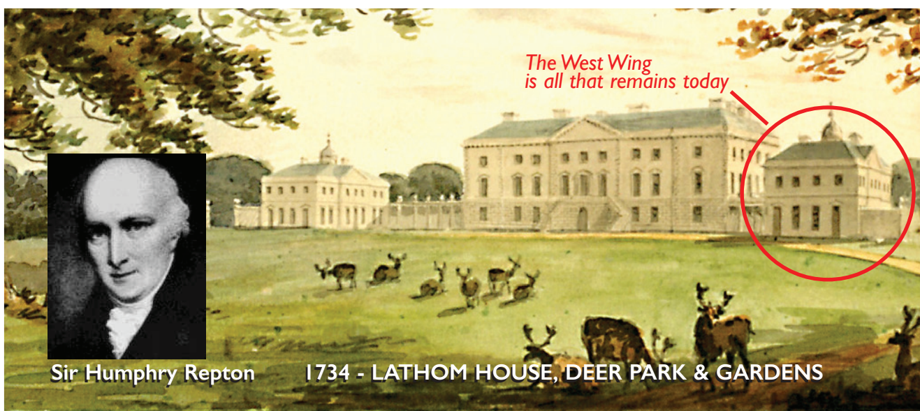
The West Wing is all that remains today