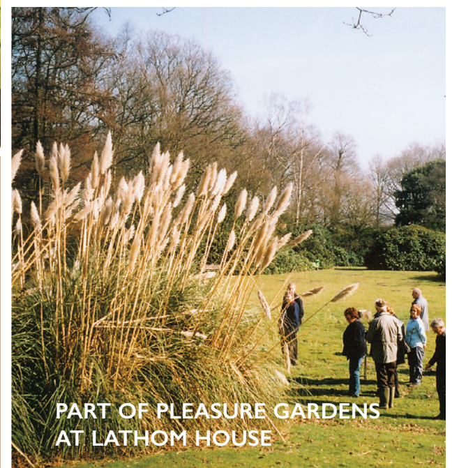
PART OF PLEASURE GARDENS AT LATHOM HOUSE