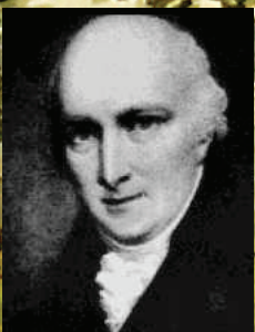
Sir Humphry Repton